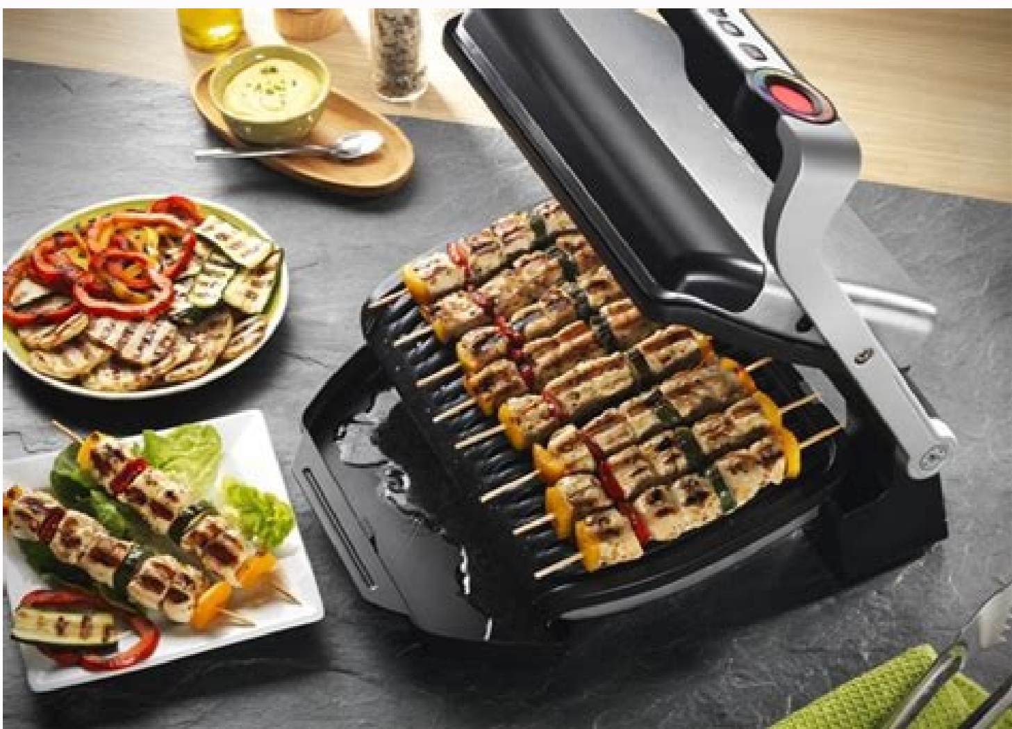
T fal optigrill operating instructions. T-fal optigrill 8351s1 reset.